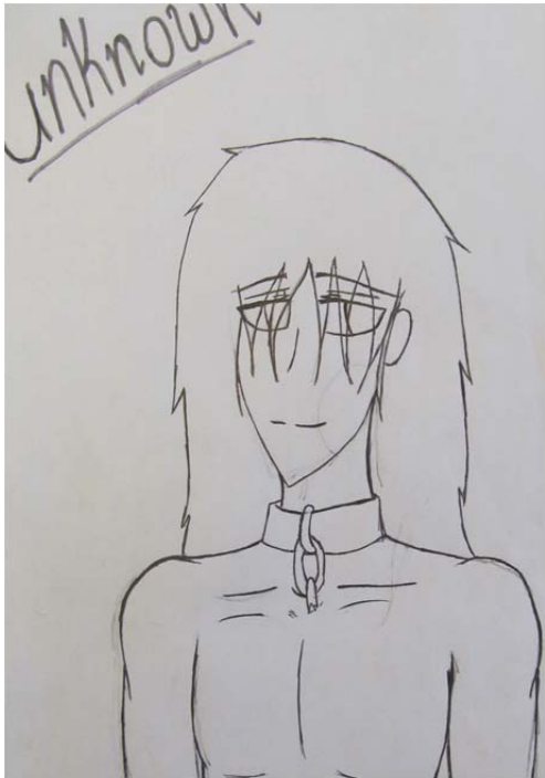
Unknown by Deja Juarbe

I'm so happy now I don't feel alone any more I'm happy when you are around I can't believe I found love I'm finally happy I'm feeling complete, no one is perfect but to me you are You are the sun that shines in the day You brighten up my sky in the night, but yet love is like a battlefield you try to protect the one you love from anyone else